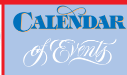
Club events p3